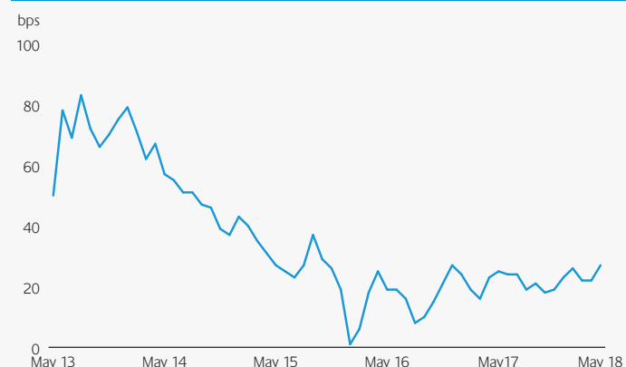
Figure 2: Asia IG spreads over US IG

Data as at 31 May 2018.