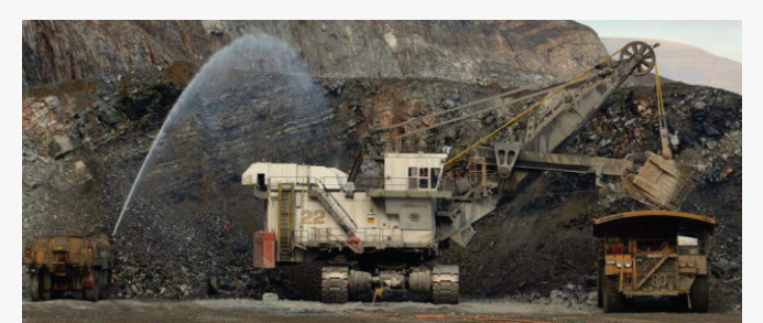
Figure 2: Lundin Mining' Candelaria Open pit near Copiapo, Chile.